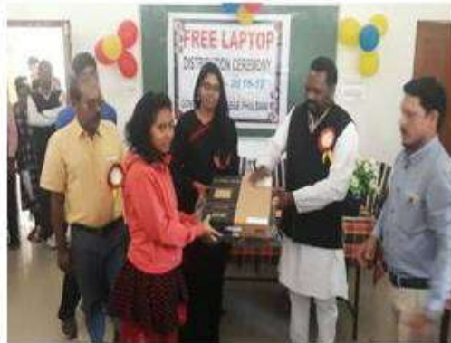
Free Laptop Distribution