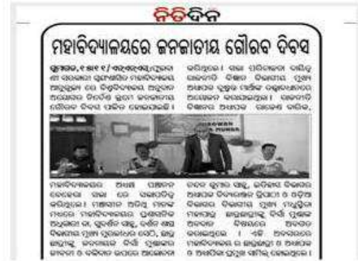
JanaJatiya Gourav Divas