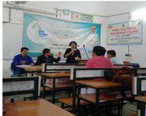
Workplace stress management program