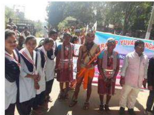
Kandhamal Mahostav celebration