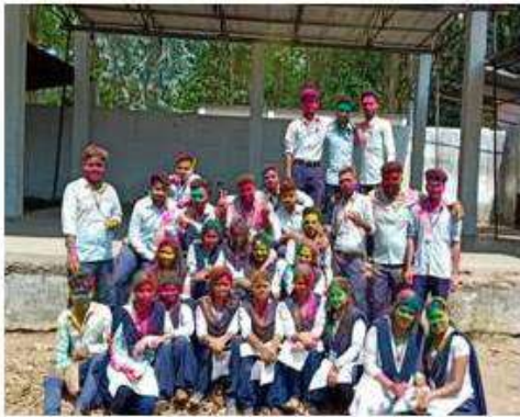
Celebration of Holi