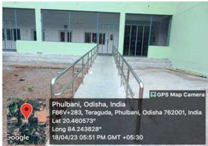
Ramps for easy access to IDP classrooms