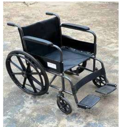
Divyangjan friendly chair