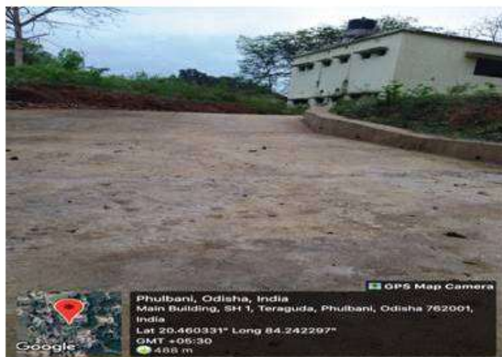
Ramps for easy access to Science Labs