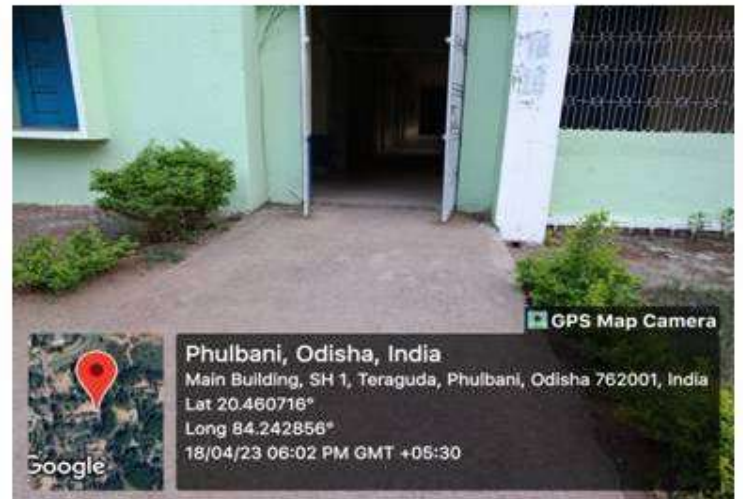
Ramps for easy access to Science departments