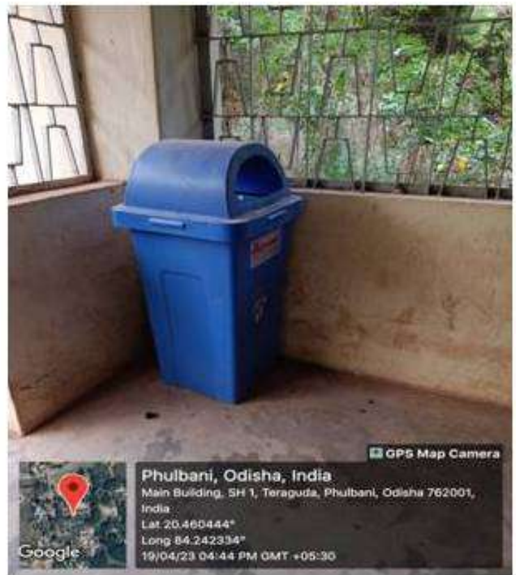
Fig-4: Dustbin at the corridor