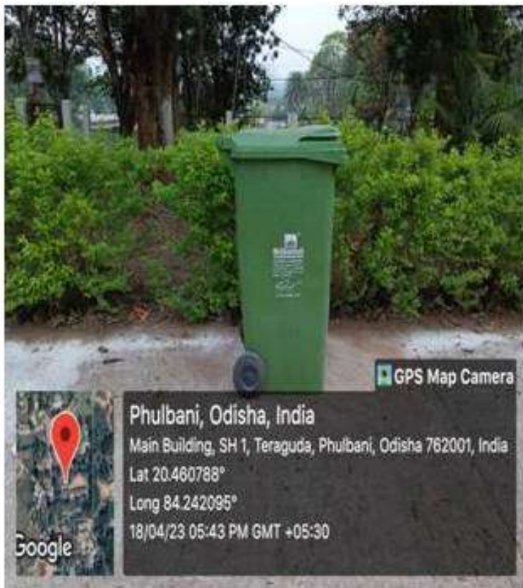
Fig-1: Dustbin in front of the Main Building