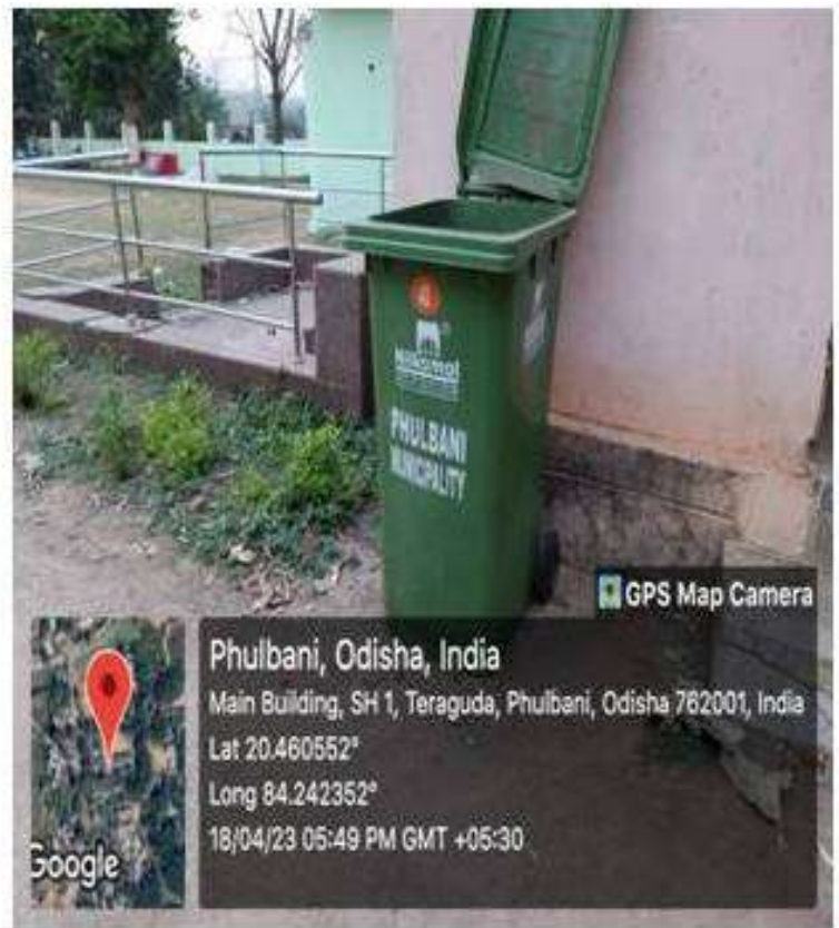
Fig-2: Dustbin near the Open Pandal