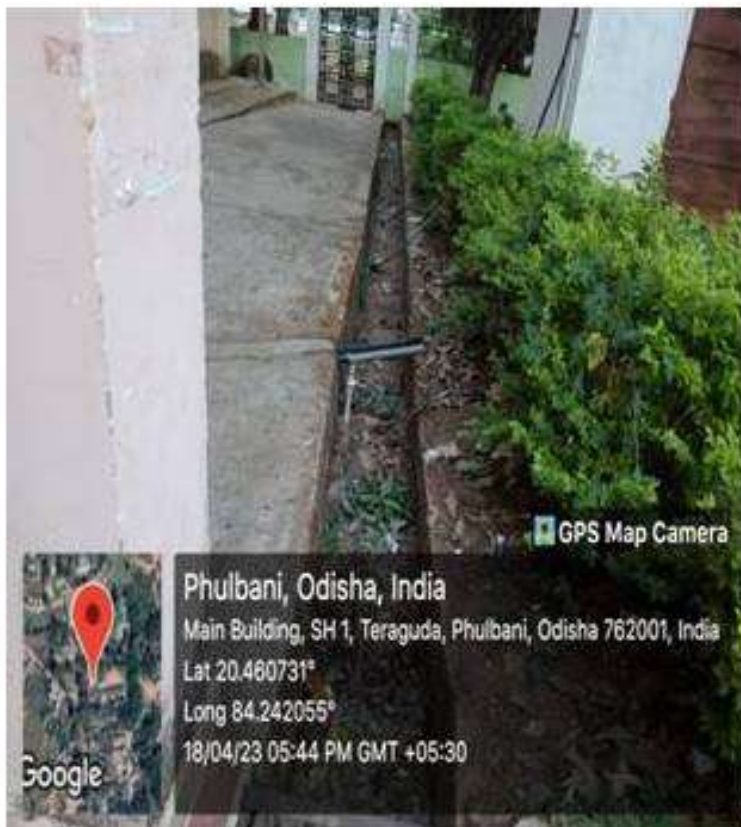
Fig-3: Drainage System