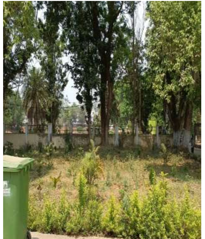
Green and Clean Campus