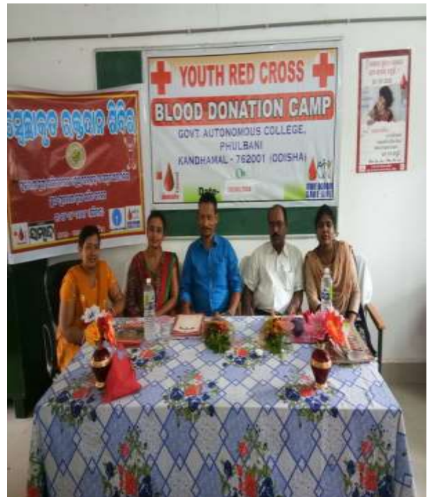
Inauguration of Blood Donation Camp – YRC Wing