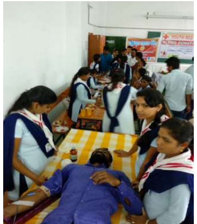
Students' active participation in Blood Donation Programme