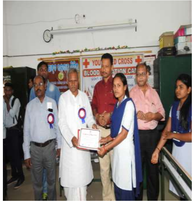
Honorable M.L.A Phulbani appreciating Blood Donors