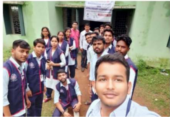
NSS Volunteers participating in various social programs