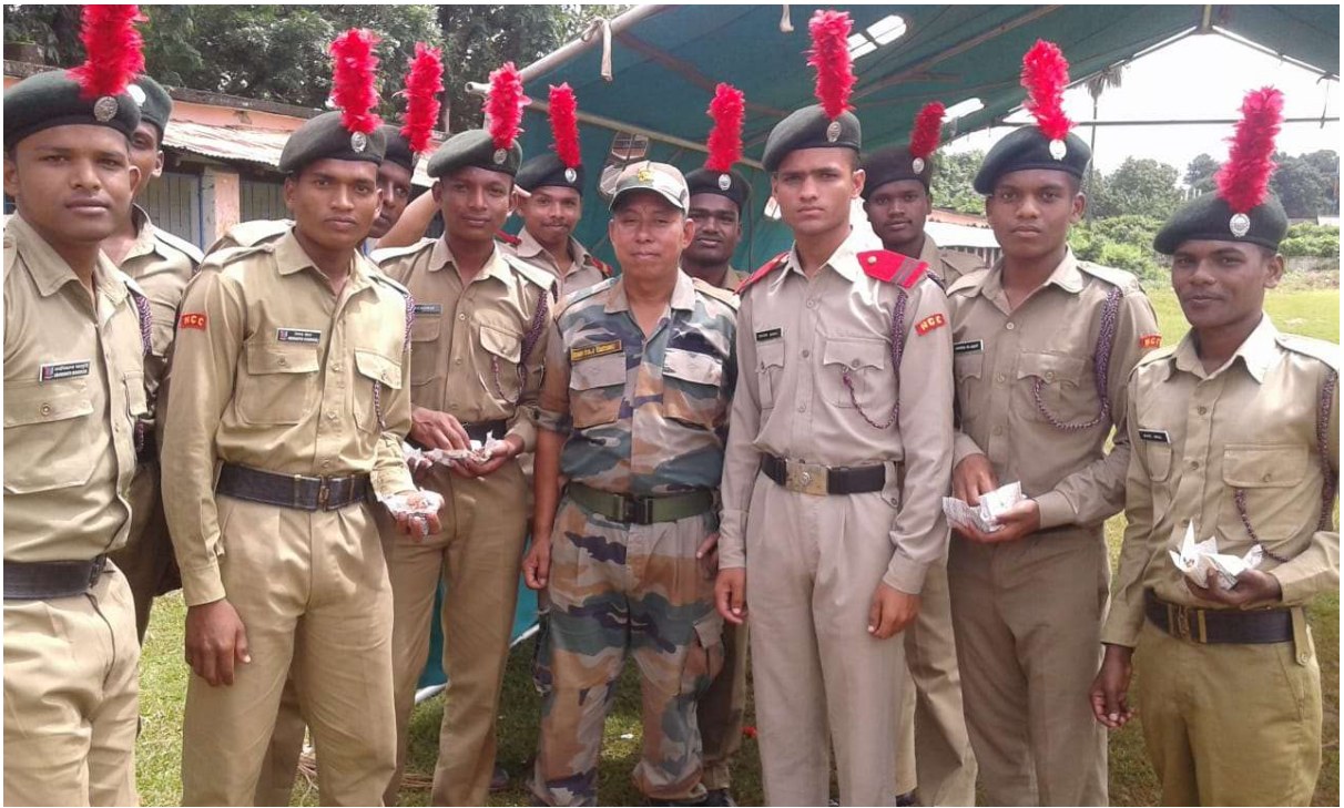
NCC Training Activities, 2018