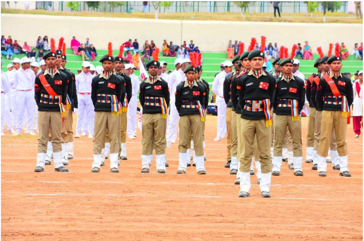
NCC Cadets participating in Dist. Level parade competition on the occasion of Republic day, 2019