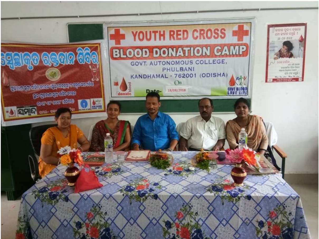
Blood Donation Activity by YRC in the year 2018