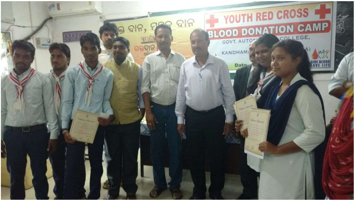
Blood Donation Activity by YRC in the year 2016