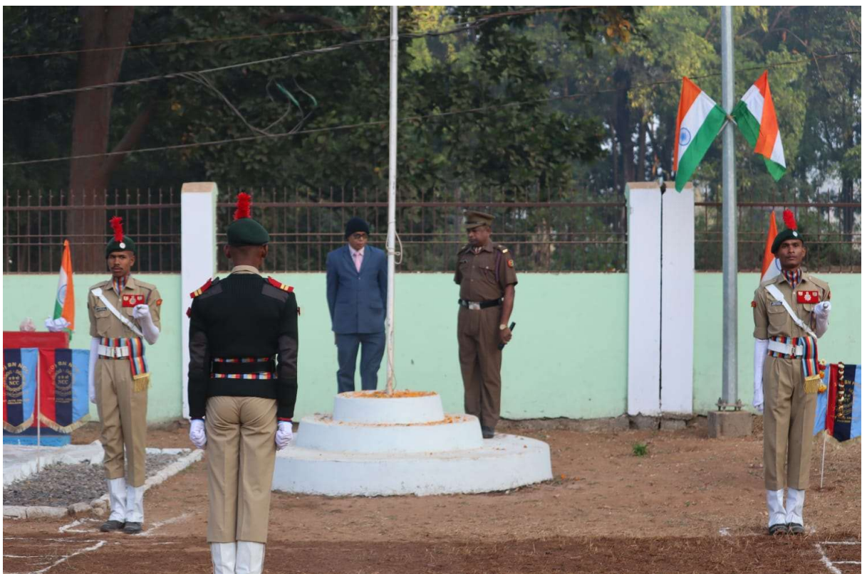
Flag hoisting by the Principal on Independence Day