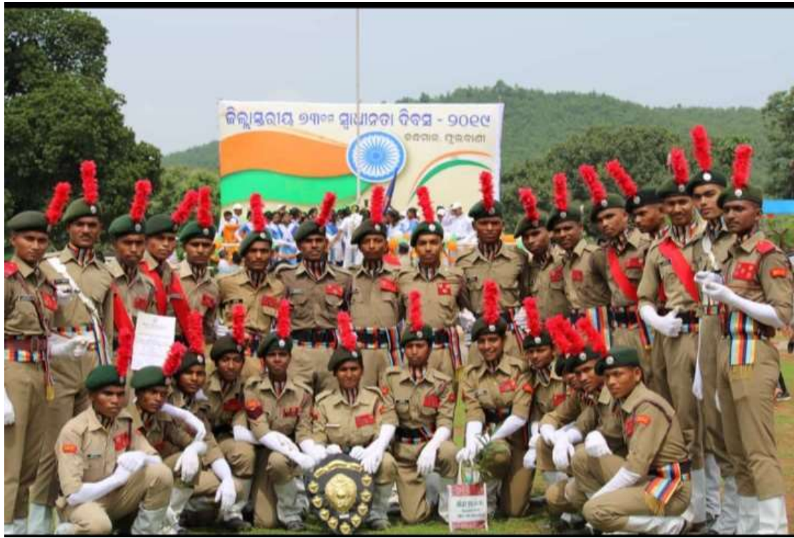
Independence day celebration in the college, 2019