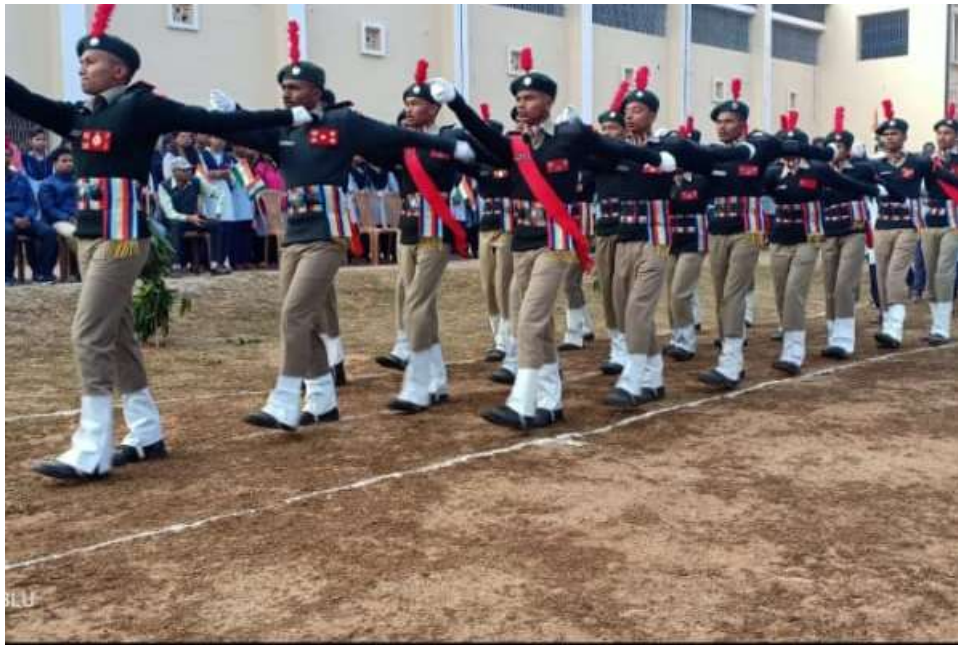
NCC Cadets performing Parade in college, Republic Day 2018